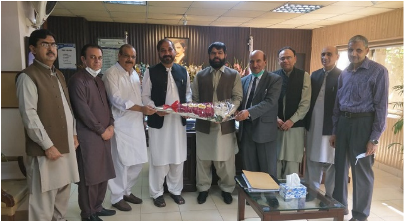
Chief Commissioner- IR, RTO Faisalabad with ADRC Members

Federal Board of Revenue (FBR) is making all out efforts to restore taxpayer's trust by taking several steps including resolution of tax disputes through constitution of Alternative Dispute Resolution Committees (ADRCs). Responding to the applicants' grievances on fast track basis, IR-Operations Wing, FBR, during the period July, 2020 to Feb, 2021, has constituted eighteen (18) Committees, under the Sales Tax, Federal Excise & Income Tax heads. Out of the said ADRCs, fourteen (14) Committees have so far successfully decided the disputes referred to the Board.