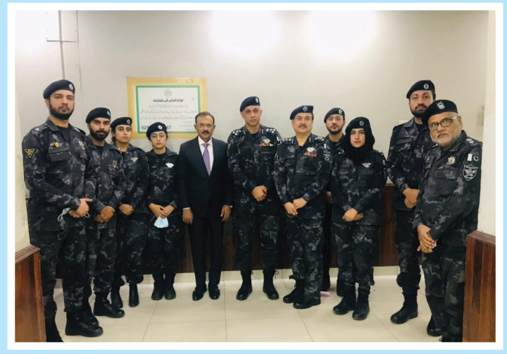
DGTR Customs, Karachi organized a visit of ACs (UT) to the office of Additional Home Secretary, Sindh on November 17, 2021