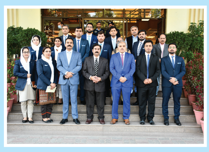
First Batch of Under Training FIA officers visited FBR on November 11,2021