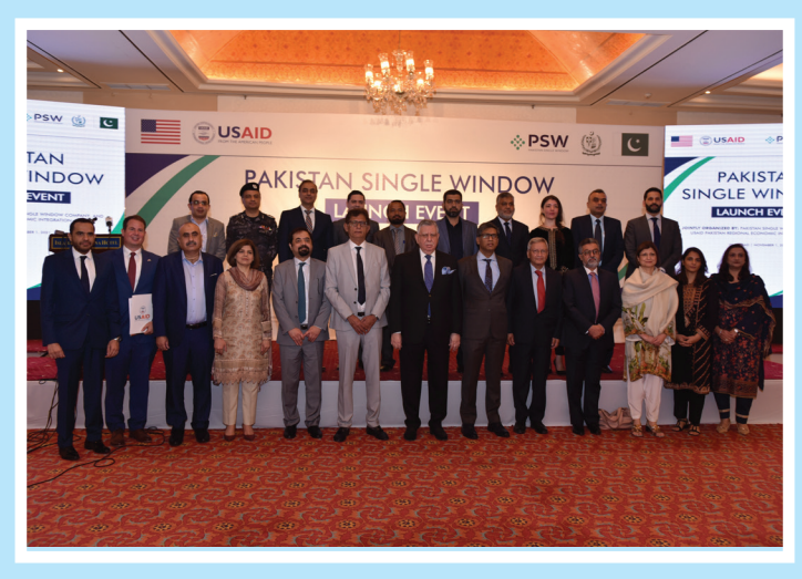
Launching of Pakistan Single Window by Advisor to PM on Finance & Revenue on November 01,2021